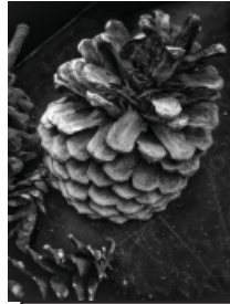
by Sage Chircu