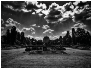
by Sage Chircu