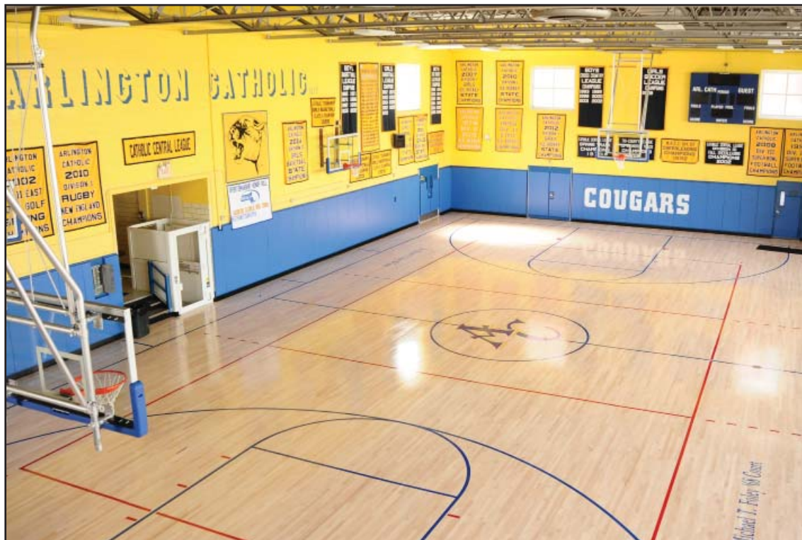
Arthur Ingalls, Geskus Photo

The Unleash the Spirit Campaign, which officially closed November 15, has raised over $130,000.