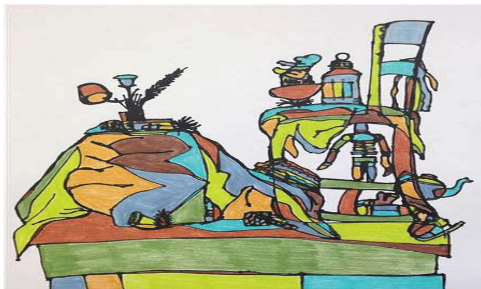
Fragments by Matthew Bulger

In the words of the Red Cross, “Giving blood can be a simple thing to do, but it can make a big difference in the lives of others.” This statement was reflected by Arlington Catholic students on Thursday, April 9th. Many students who met the requirements to give blood willingly volunteered to participate in this good cause. The gym was open all day to students who signed up. Many faced anticipation and nerves leading up to the actual donation; nonetheless, these feelings of uneasiness were overshadowed by the life changing act of each individual. From personal experience, the act of donating blood brings a sense of accomplishment as you know that someone in need of a blood transfusion can be saved by the simple deed performed. With the successful turnout this year, the Red Cross hopes that many other students are willing to participate in this do-good cause next year.